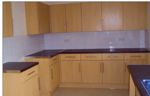
Rent arrears in December 2009 totalled the equivalent of 15 new kitchen installations

We believe that these are reasonable expectations of a responsible landlord.