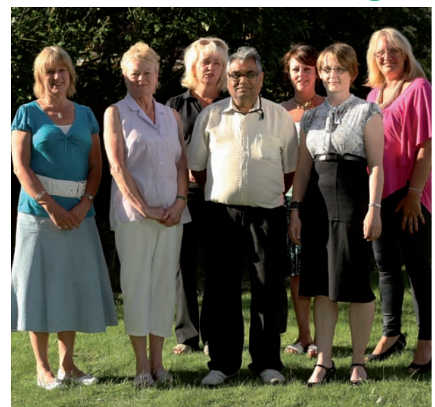
Guests are always welcome to attend Challenge Group meetings