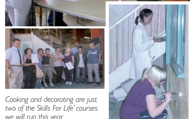
Cooking and decorating are just two of the Skills For Life courses we will run this year

provide you with some vouchers or materials to help you make the most of your new skills when you get home.