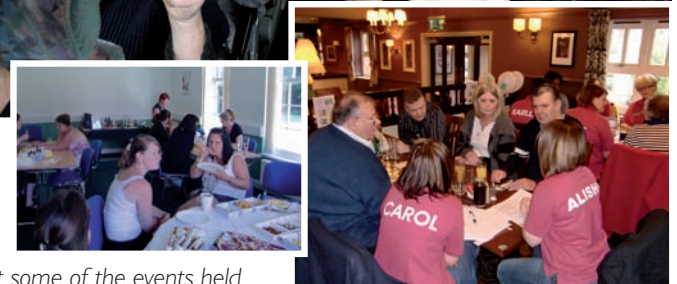
Just some of the events held where RFHA has learned from the feedback gained from our residents